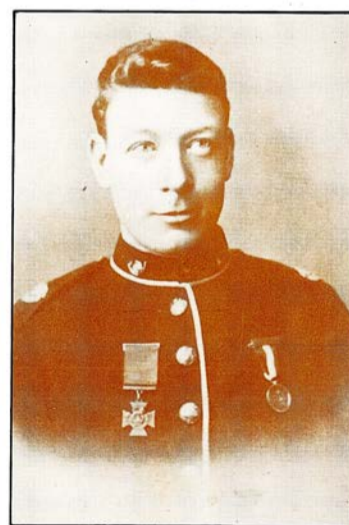
CHARLES BURLEY WARD, V.C.