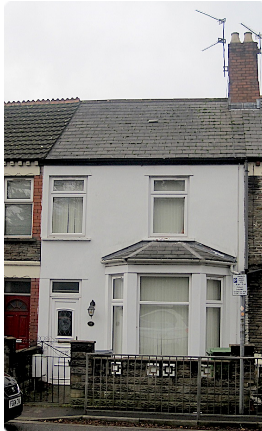
55, Allensbank Road, Heath.