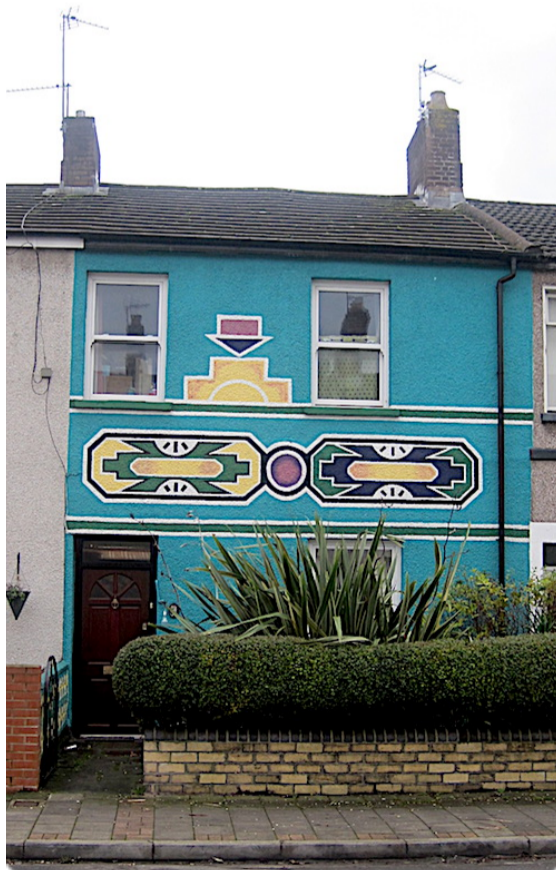
58, Elm Street, Roath.