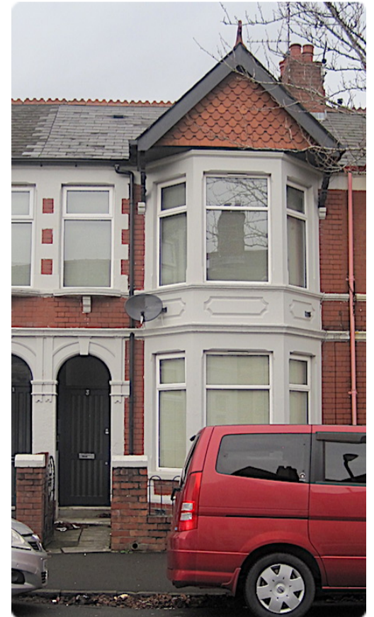
3, Soberton Avenue, Gabalfa.